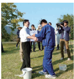
Exchanging brood fish with Tokushima Prefectural Senior High School of Science and Technology