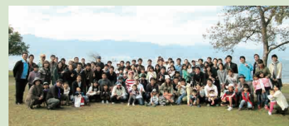
Participants in the fishing tournament