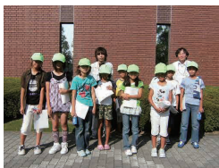
Otsuka Pharmaceutical: Children in forest tree class