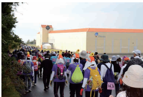
Otsuka Pharmaceutical: Asan Walking Festival in Itano