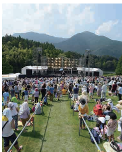
"Exciting Summer in Wajiki" concert

With the cooperation of local residents, the factories of the Otsuka Group hold various events for community revitalization. Every year since 1990, together with Otsuka Techno, the local government, and the chamber of commerce and industry, Otsuka Pharmaceutical's Tokushima Wajiki Factory has held a free outdoor concert, "Exciting Summer in Wajiki," on the lawn of the factory grounds. Otsuka Pharmaceutical's Tokushima