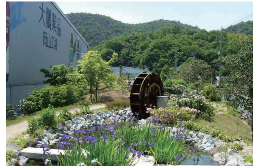
Taiho Pharmaceutical: Biotope at Okayama Plant