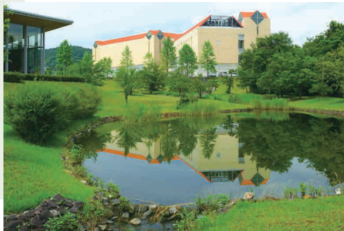
Otsuka Pharmaceutical: Biotope at Tokushima Itano Factory

As part of its biodiversity conservation activities, the Otsuka Group promotes the creation of biotopes to preserve natural habitats for wildlife and to build harmonious relationships with the natural environment.