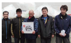
J.O. Pharma: Recycling rate increased through promotion of plastic recycling