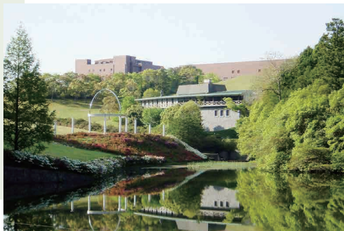
Otsuka Pharmaceutical: Tokushima Wajiki Factory

With the aim of helping to create a recycling society, the Otsuka Group is actively striving to achieve zero waste for final disposal, through recycling and reduction of waste.