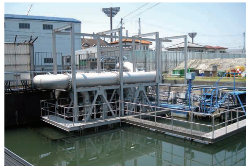
Otsuka Pharmaceutical Factory: Naruto Factory