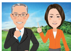
Otsuka Pharmaceutical: "Otsuka Academy of the Environment" educational tool