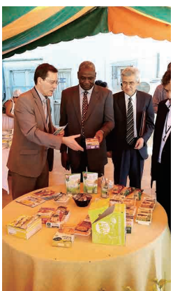
Tofu for Africa partnership to help the people of Burkina Faso produce tofu