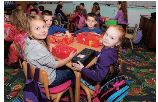
Otsuka Pharma GmbH: Participation in the Kinderzukunft (children's charity) Christmas present campaign