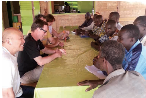
Nutrition & Santé: Tofu for Africa