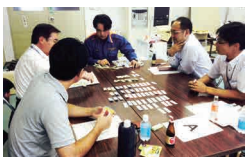
Employees and city officials brainstorming ideas in a joint meeting

After brainstorming various ideas, we plan to take concrete action. By utilizing cooperation between industry, government and academia, the aim is to create mechanisms for locally generated activities in Owariasahi.