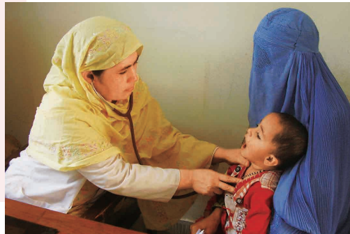
Otsuka Welfare Clinic