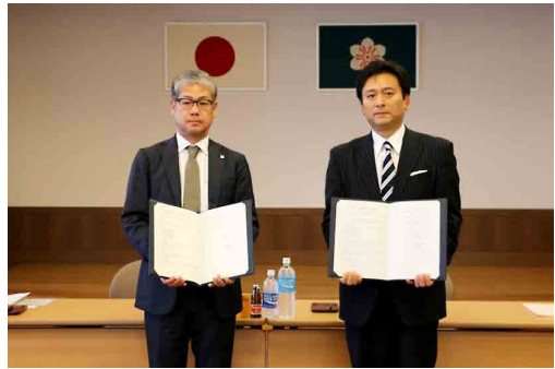
Otsuka Pharmaceutical: Cooperation agreement signing ceremony with Governor Yamaguchi for health promotion in Saga Prefecture