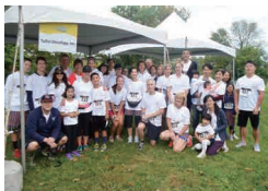
Taiho Oncology: Sponsorship and participation in a charity run for colon cancer

In order to realize our corporate philosophy, Taiho Oncology strives to help create smiles in the local community. As a company, we recently participated in and sponsored a charity run organized by a local organization for colon cancer patients to raise money for colon cancer prevention, R&D, and patient support. By meeting with cancer patients, it was also an opportunity for employees to once again realize serious unmet medical needs, while further strengthening teamwork.